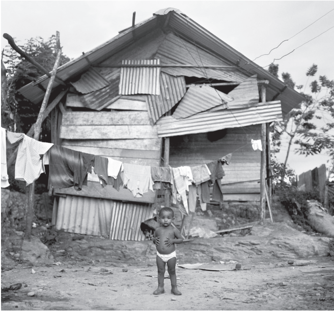
A child standing near a washing line outside a corrugated iron house in the slums of Sincelejo. Many Colombians are now living in slum areas after fleeing their homes due to political violence. This migration is part of the cycle of violence and forced internal displacement that affects large numbers of people (Sincelejo, Sucre, Colombia).

societies, and formal insurance markets develop alongside economies, but many risks cannot be significantly reduced. These are risks that either affect most people in a community (for example, a natural hazard, a highly infectious disease, or economic recession), or that cannot be insured against, because formal insurance markets do not exist. 13