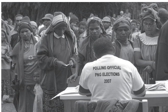
Local villagers and clanspeople congregate at the remote Kiburu polling station to cast their votes in the 2007 general election (Mendi, Southern Highlands, Papua New Guinea).

Islands it is the vast distances that have hindered construction of a social compact. People in outlying islands perceive that the centre has done little for their lives, while rapacious politicians and entrepreneurs have contributed to extracting the nation's natural resource base.