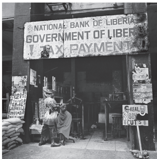
A hairdresser cuts a customer's hair in a makeshift barbershop that he has set up in the abandoned tax department of the derelict National Bank of Liberia (Monrovia, Liberia). Photo © Tim A. Hetherington/Panos Pictures (2005).

Donors can play an important role by providing stable and consistent aid flows for key social protection measures and social sector expenditures.