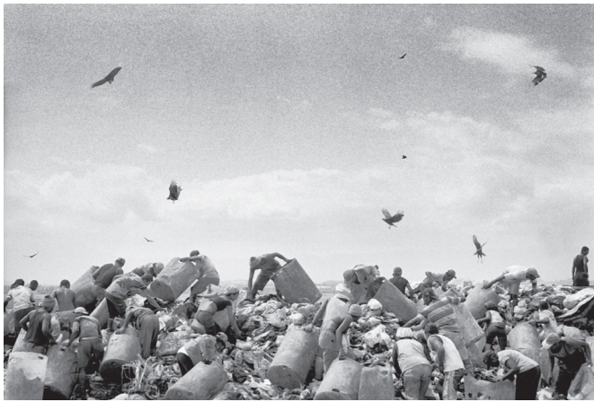
Scavengers searching through rubbish on the municipal dump (Rio de Janeiro, Brazil).

In summary, there are many ways to enhance the agency of the chronically poor. Ultimately, all involve building individual and collective assets, including the vital psychological asset of self-esteem. Thus, the indigenous Ecuadorian movement which influenced the new (1998) constitution not only enabled a wide raft of legal rights (such as land, education, language and health), but also gave confidence to indigenous peoples (see Box 43). Social protection releases individual potential, especially when it supports educational achievement. The Maharashtra Employment Guarantee Scheme, and now the National Rural Employment Guarantee Act, enables workers to negotiate better wages. 14 By giving cash only to women, Mexico's Progresa programme strengthens the power of women in the household. 15 India's school feeding schemes increase girl enrolment and attainment (see Box 51). 16 Bangladesh's Cash for Education programme has secured full gender parity in primary education and near parity in secondary education. 17 All of these measures build up a wide range of material and non-material assets, thereby opening escape routes out of chronic poverty.