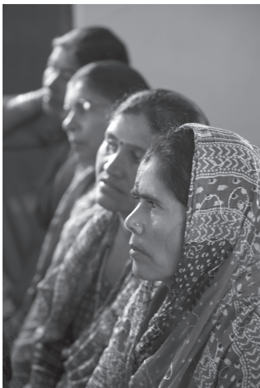
Women attend a meeting organised by an NGO for influential members of the local community in which reproductive health issues are discussed; with the aim of their disseminating this information within their community (Nepalganj, Nepal).

through a large family. However, as there is an association between chronic poverty and large household size (especially in South Asia), this means that it is increasingly hard for policymakers to ignore the issue.