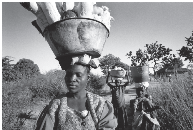
Women carry baskets of cassava on their heads, after receiving the food as payment for working on a farm. Since food rations from the World Food Programme (WFP) have been cut, refugees have had a hard time finding food. The immediate post-conflict period in Angola from April 2002 has seen hundreds of thousands of refugees return to the country after more than 30 years of civil unrest. (Tsisumbuluv, Angola).

Intuitively, this approach favours conditional cash transfers focused on human capital development, since these address both immediate needs and longer term (and intergenerational) deprivation. The evidence does not wholly support this intuition, since poor households manage their resources very sensibly, often (if not always) with an eye to human development. While most conditional cash transfers are paid on the condition that, for example, the children of the household are attending school, it is generally not required that the transfer is spent on the children. Nevertheless, elites are frequently sceptical about the ability of poor households not to 'drink away' unconditional transfers, and therefore conditional transfers may have greater policy traction, as discussed below. Moreover, one of the most important advantages of conditionalities is that Ministries of Education and Health become fully involved in the poverty reduction process.