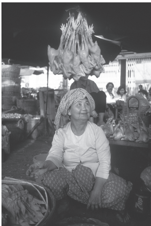
Chicken seller in the early morning market (Phnom Penh, Cambodia).

All of this is promising, but far from definitive. The evidence is not yet extensive enough, in part because there have been too few research efforts. We need more data collection to study the output and employment effects in areas where households receive cash transfers. This report urges the development community to make this an urgent research priority, bringing to bear the full range of techniques necessary to pinpoint the growth effects, as well as the poverty reduction effects, of social protection. Social protection addresses poverty and vulnerability in ways that few strategies can, and it does not have adverse effects on incentives to work – that it is likely to foster pro-poorest growth is icing on the cake.