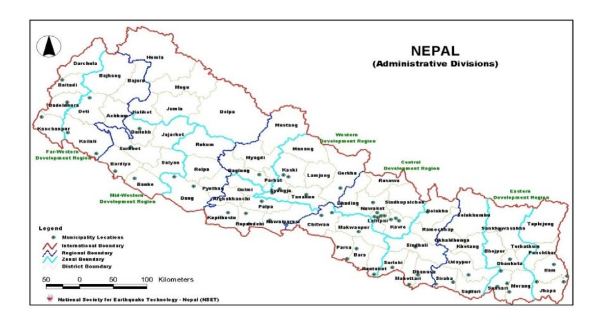
Figure 2 Map of Nepal Administrative districts

Each rural site plays a significant role in trafficking either as an exit/transit point to India or an entry/transit point to Nepal. At the Shakti Samuha Annual conference of trafficked survivors in 2009, presentations from members coming form the rural districts reported that traffickers are moving women from the South East to traffic them through the far west region into India<sup>10</sup>. They argue that the success of NGO awareness training in the east central area and around that border region is forcing a shift in trafficking flows. Samarasinghe (2008) suggests that monitoring of the most frequently used crossing points is forcing traffickers to use more difficult routes despite transport challenges.